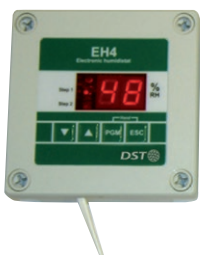
Display: RJ9 cable low voltage Standard 25 m. Optional extension kit, (200 metres max)

Option: External display. Display and key set via a 25 m low voltage cable