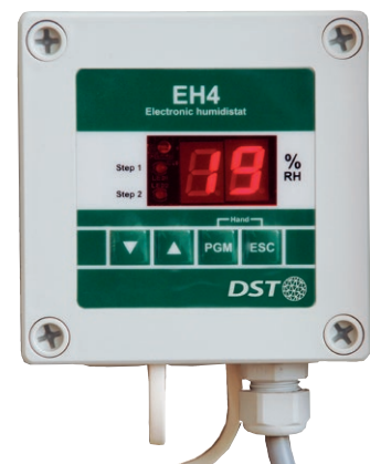
EH4 and standard room sensor IP65. Room sensor: low voltage 3 m. Optional: 25 meters RJ9 extension cable (50 meters maximum)

Option: External display. Display and key set via a 25 m low voltage cable