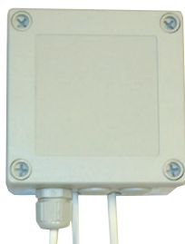
Relay: 230V supply